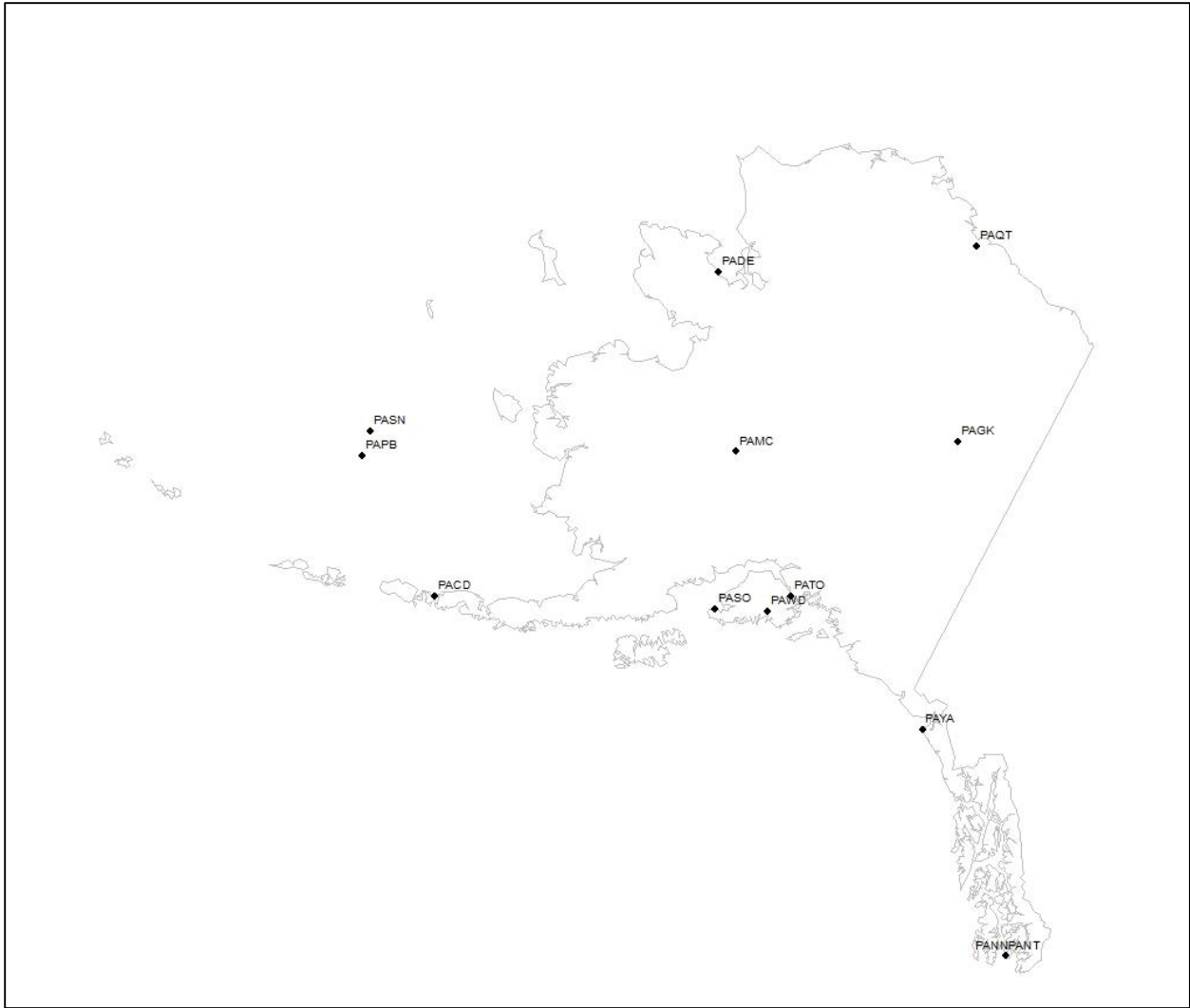
Figure B-2. Locations of ASOS stations in Alaska with missing June-December 2013 1-minute data files.