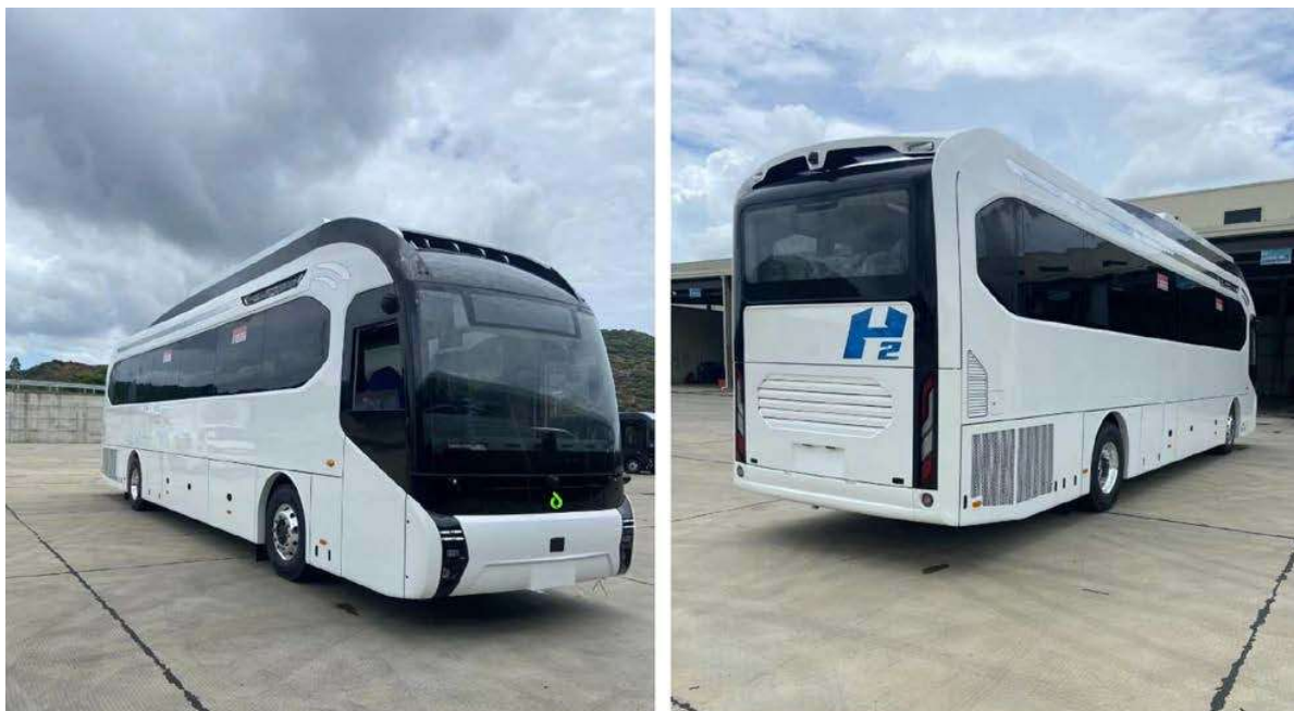
Image 3 and 4: Image of the FC120 Low Floor City Bus front and back, respectively

With respect to Pure's stated vehicle development strategy, the agreements serve to further demonstrate the ongoing traction Pure Hydrogen is building for its leading suite of hydrogen and electric solutions for the heavy vehicle industry in both domestic and international markets.