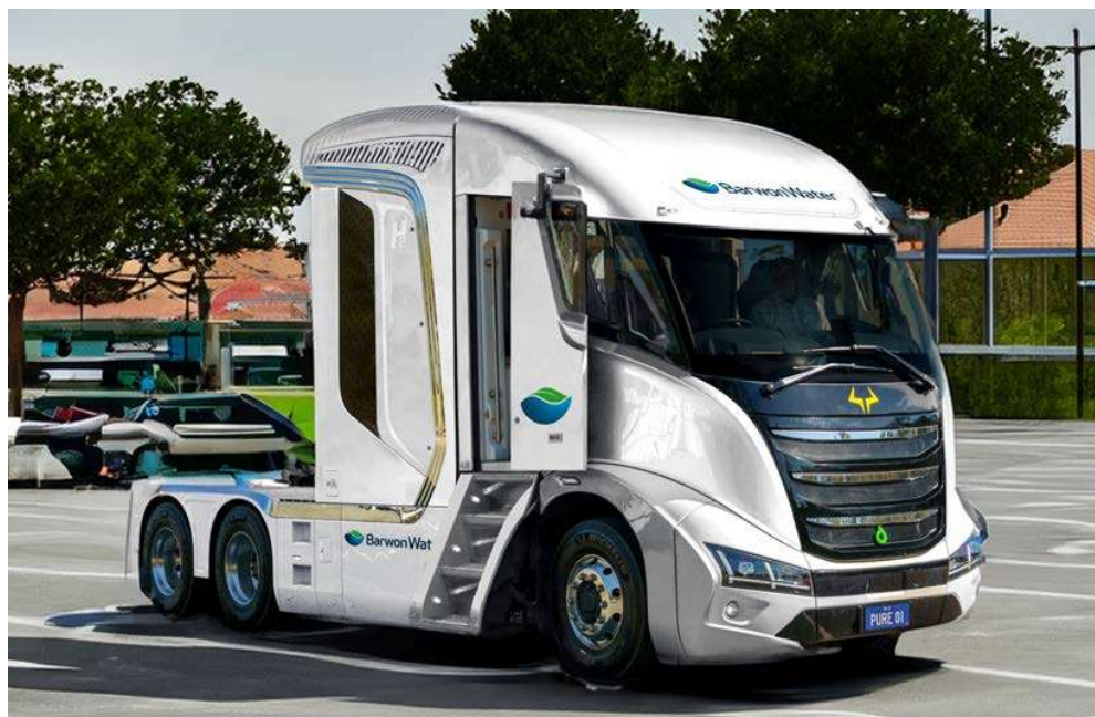
Image 1: A similar version of the Taurus HFC Prime Mover to be supplied