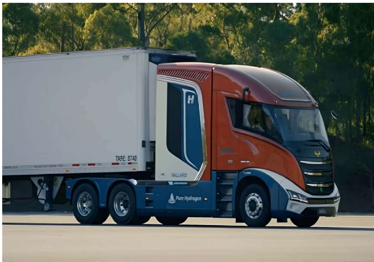
Image 2: Image from Queensland Government's ad featuring the Taurus HFC Prime Mover

Pure Hydrogen is currently evaluating the Taurus truck's performance, particularly focusing on operational uptime, fuel efficiency, learnings and looking at further testing and trials on different routes once full approvals are received and 700 bar refuelling is available, which will allow for unrestricted operations across a broader range of routes.