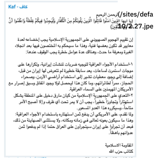
Figure 2: KH statement, October 27, 2024.

KH had previously led an attack against Tower 22 in Jordan, which resulted in the deaths of three American service members. In response, KH faced potent U.S. strikes, prompting them to halt operations temporarily to prevent further escalation.