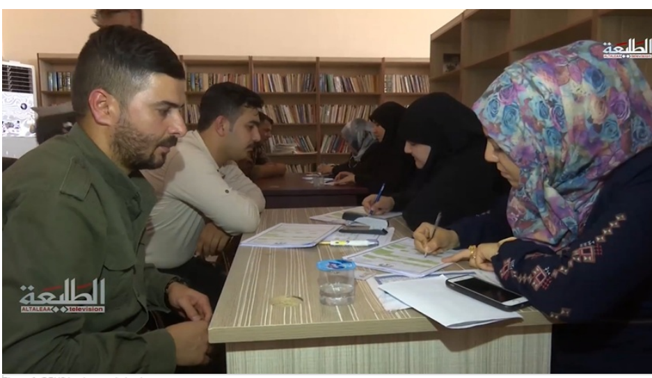
Figure 1: DEHS background check