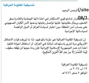
Figure 1: Tansiqiya statement, August 12, 2024.

On August 12, the Iraqi Resistance Coordination Committee (https://www.washingtoninstitute.org/policy-analysis/their-own-words-senior-leaders-admit-membership-tansiqiya) (al-Haya al-Tansiqiya lil-Muqawama al-Iraqiya, or Tansiqiya for short) issued a short statement. The statement read “The Iraqi Resistance Coordination is not bound by any restrictions, if the American occupation forces get involved again in targeting our sons in Iraq or exploit its airspace to carry out attacks against the Islamic Republic of Iran. In that event our response will not be stopped by restrictions...” (Figure 1).