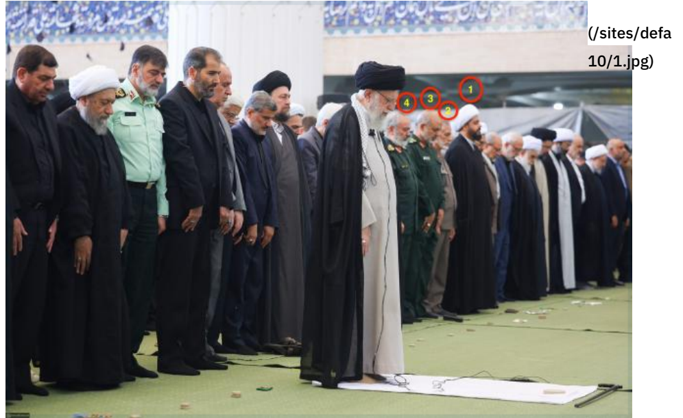
Figure 2: Friday Prayers led by Khamenei on October 4, 2024. 1. Khazali, 2. Shirazi, 3. Vahidi, 4. Fadavi.

Similarly, in May 2024, Khazali was given a prominent position near Khamenei