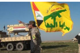
Profile: Saraya al-Jihad

(/policy-analysis/how-use-militia-spotlight)