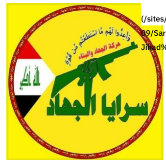
Saraya al-Jihad logo