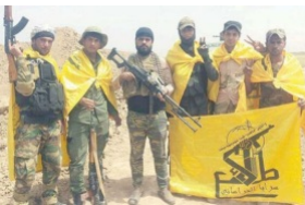
Profile: Saraya Talia al-Khurasani

(/policy-analysis/profile-saraya-al-jihad)