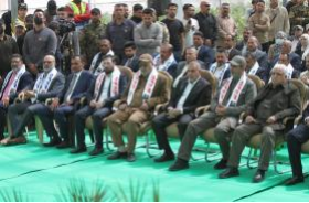
How to Use Militia Spotlight: Profiles

(/policy-analysis/how-use-militia-spotlight-profiles)