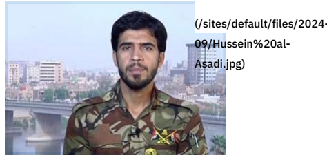
Figure 1: Hussein al-Asadi, a high-ranking SJ leader, on the Asaab Ah al-Haq (AAH)-owned Al-Ahad TV threatening to retaliate against (then) U.S. President Donald J. Trump and U.S. forces in Iraq in the aftermath of the 2020 Soleimani-Mohandis airstrike in Baghdad. (January 5, 2020).