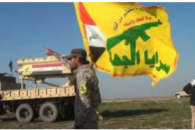
Profile: Saraya al-Jihad

(/policy-analysis/how-use-militia-spotlight-profiles)