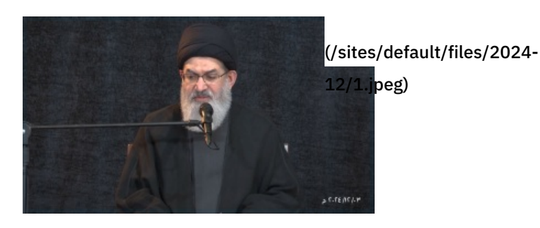
Figure 1: Sayyed Hashem al-Haidari addresses seminary students in Iraq about recent developments in the region, December 3, 2024 (video published on Haidari's Telegram channel on Dec 6, 2024.)

Sistani, the country's highest Shia authority. He further stated that the incoming Trump administration would soon usher in an escalatory phase, noting the president-elect's supposed statements to this effect. He also emphasized the need to "be ready and read the enemy with realism."