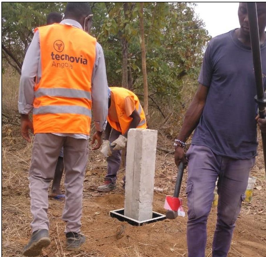
Figure 1 - Cabinda Phosphate Project, licence marker installation.