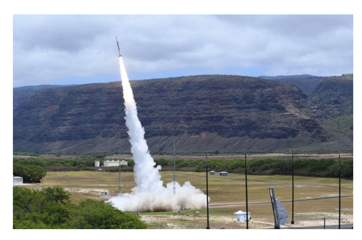
Experimental Rocket Launch