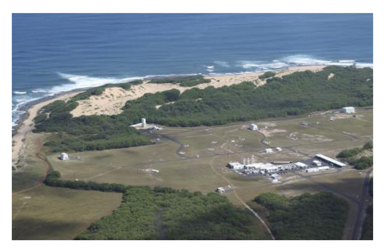
Kaua'i Test Facility