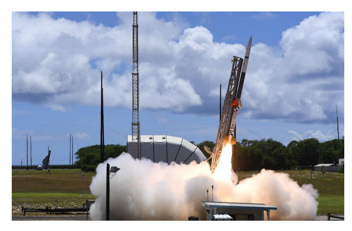
Rocket launch at the Kaua'i Test Facility