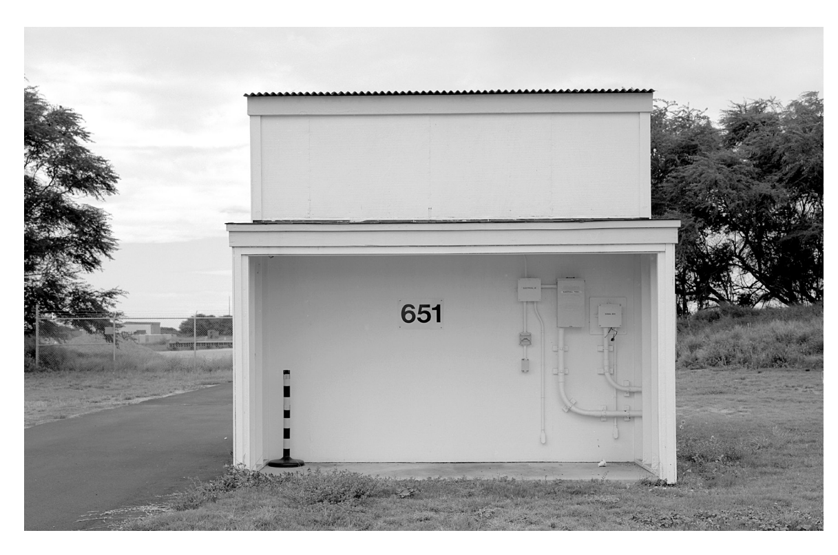
Building K651, Balloon Release Building, 2006