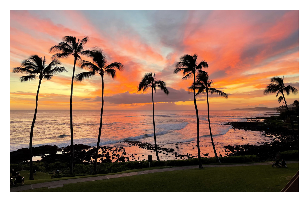
Poipu Beach sunset

WATER QUALITY AND ENVIRONMENTAL RELEASE, RESPONSE, AND REPORTING PROGRAMS