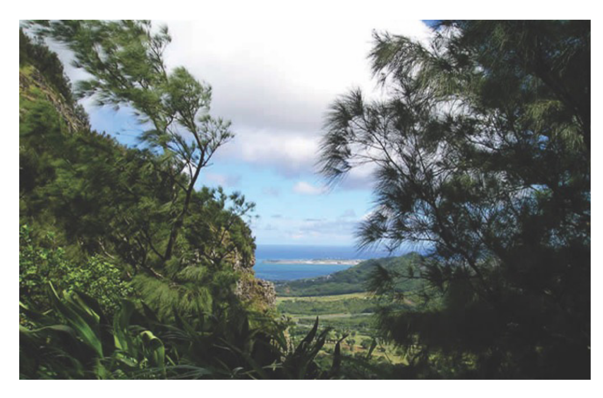
Island of Kaua'i