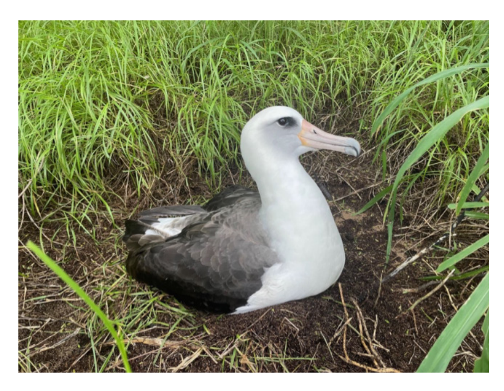
Laysan albatross ( Phoebastria immutabilis ) nest located on November 29, 2023