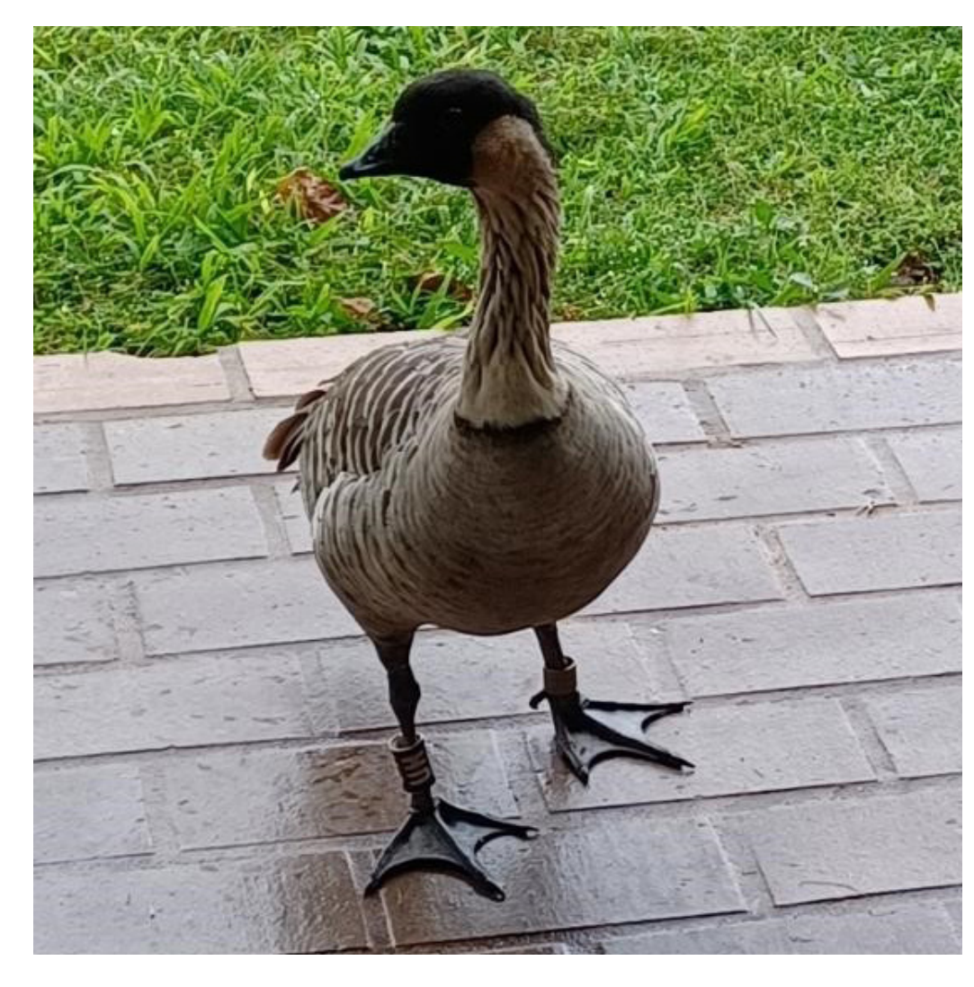
Hawai'ian goose (Branta sandvicensis)