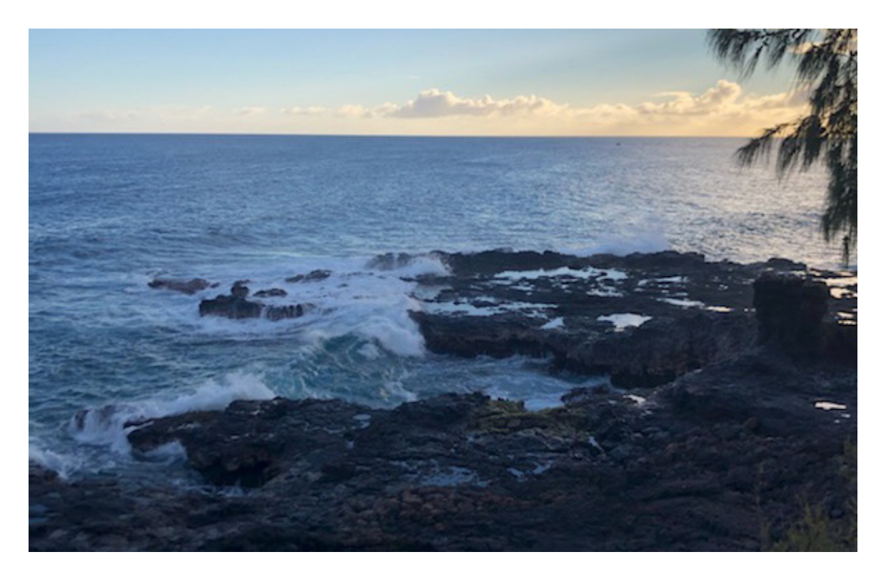
Kaua'i ocean view

Sandia personnel use on-site meteorological instruments at SNL/KTF during test periods to characterize ground-level and atmospheric wind conditions. Climatic information is obtained from Pacific Missile Range Facility personnel when needed, and the Pacific Missile Range Facility Emergency Operations Center automatically issues severe weather notifications to all SNL/KTF resident personnel.