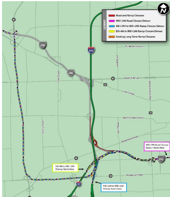
WB I-290 Road and Ramp Closure Detours