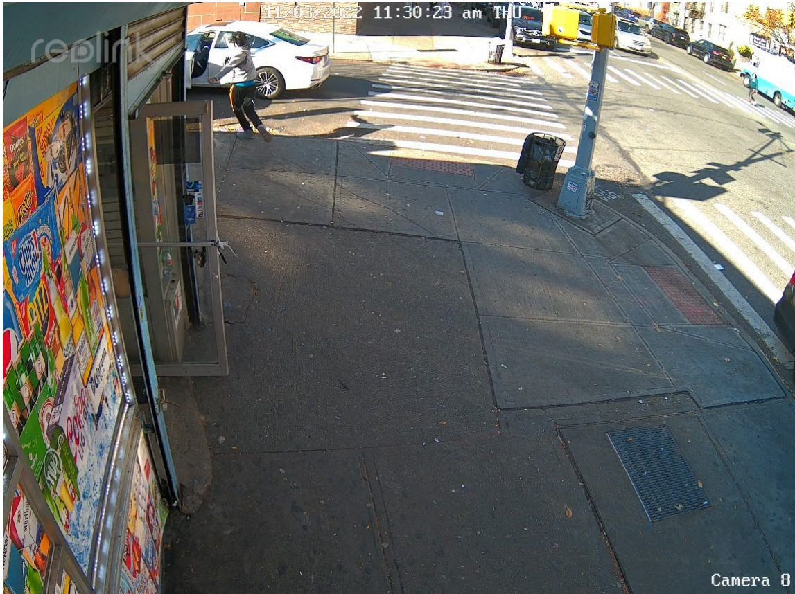
Still frame from security video at 330 E Gun Hill Rd (facing west) showing Mr. Lockett approaching AD's car with the gun raised, and showing AD getting into the driver's seat and closing the door.