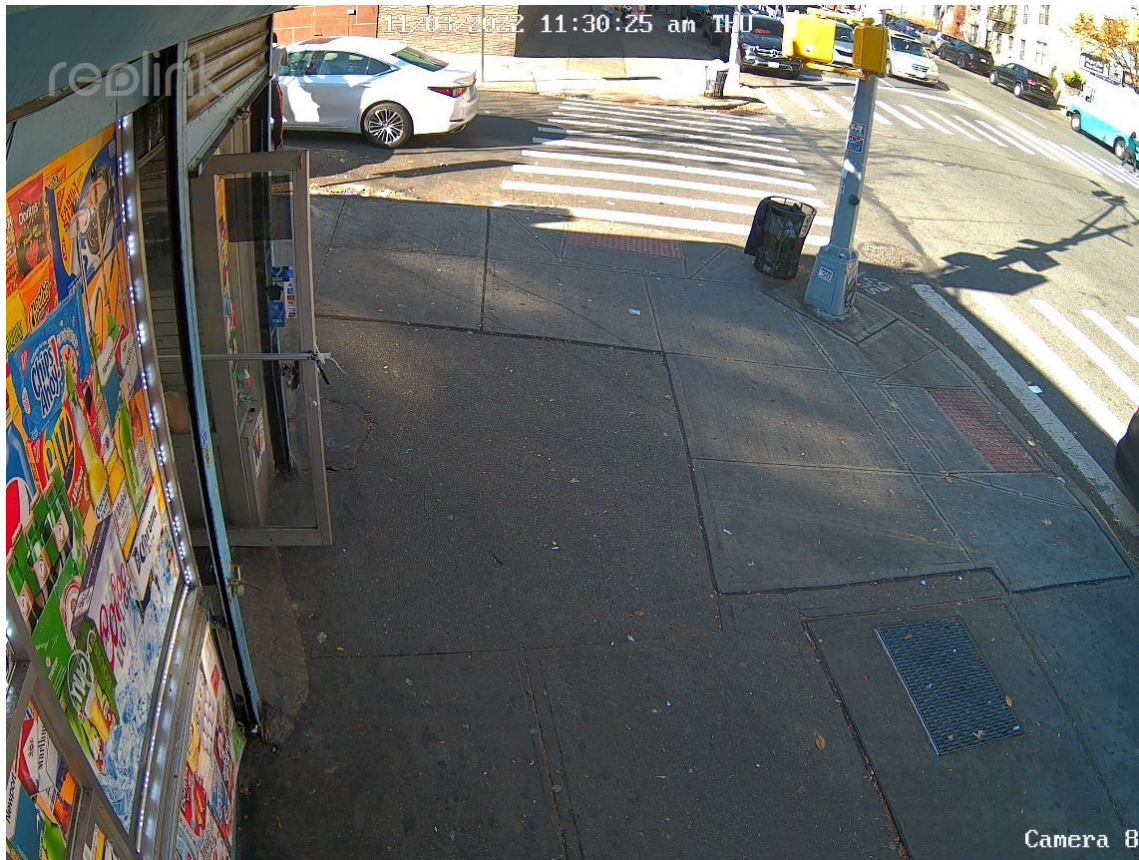
Still frame from security video at 330 E Gun Hill Rd (facing west) showing Mr. Lockett standing next to AD's car with the gun pointed at the driver's side window.