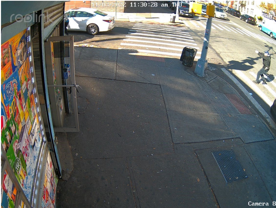
Still frame from security video at 330 E Gun Hill Rd (facing west) showing Detective Sullivan coming into view of the camera with gun raised, while Mr. Lockett turns to run to the left.