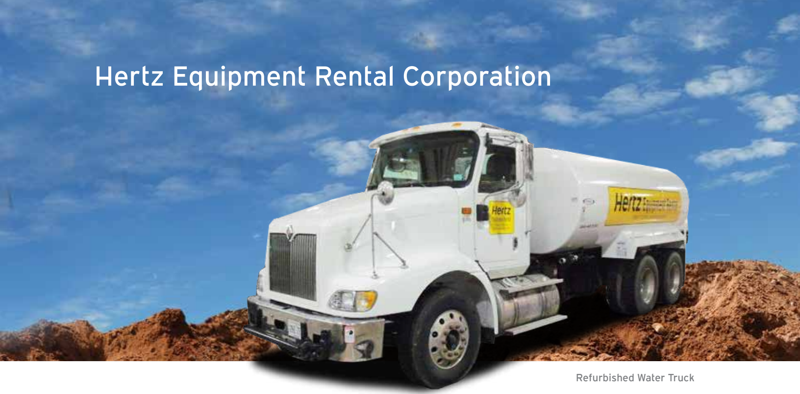
Refurbished Water Truck