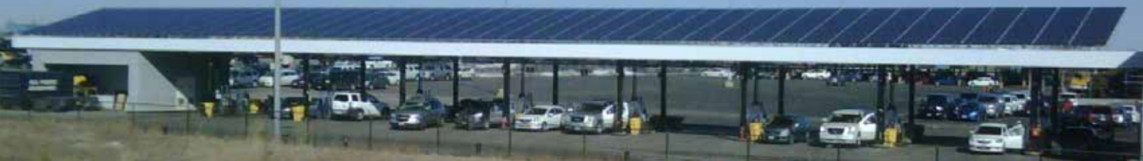
Denver, CO. Airport

Hertz has also installed display screens at all locations that generate solar power to help educate Hertz employees and customers about renewable energy. The screens show Hertz real-time solar energy production, solar fast facts and renewable energy educational content. In addition to digital displays, Hertz also gives employees tours of our solar panel systems to further promote and inform stakeholders about renewable energy.