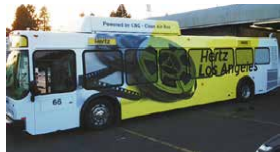
CNG Bus Los Angeles, CA

As part of Hertz' commitment to energy-efficient and cost-effective transportation we're exploring a range of cars and buses that use alternative fuels and technology, such as hybrids, EVs, clean diesel and compressed natural gas (CNG) vehicles.