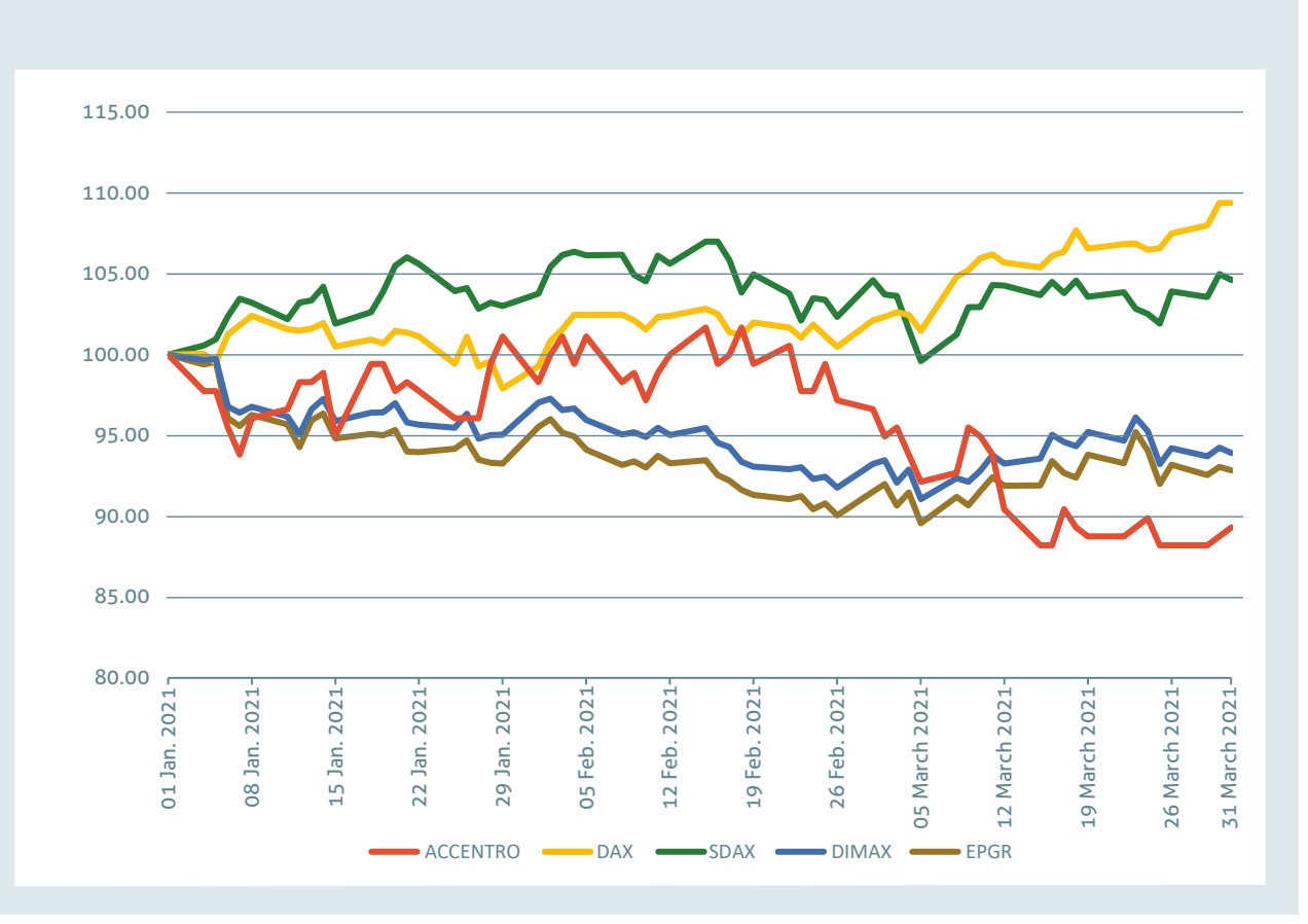
ACCENTRO share price development during the first quarter of 2021 (Xetra prices, indexed)