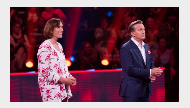
Beat the Chasers Saturday, 8.30pm 25th September ITV

More willing challengers go head-to-head with not just one, but all six Chasers. With big cash prizes up for grabs, who has what it takes to Beat the Chasers?