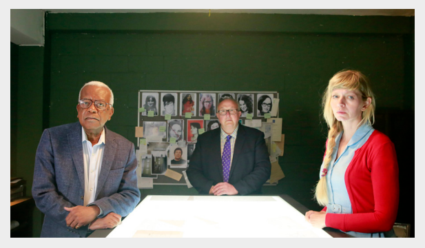
01 | Fred and Rose West: Reopened Broadcast - 15th September, ITV. Police investigate areas they suspect Fred West buried more bodies.