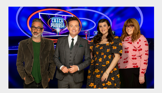
Celebrity Catchphrase Saturday, 6.30pm 25th September ITV

Celebrity special of the popular family game show hosted by Stephen Mulhern, in which the panel of celebs identify familiar phrases by way of fun animated clues.