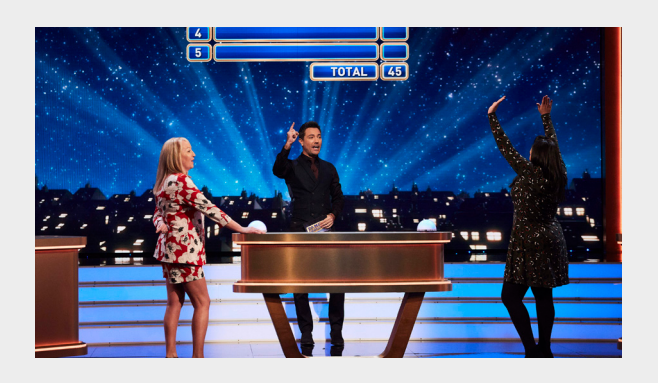
Family Fortunes Sunday, 7pm 26th September ITV

Gino D'Acampo is our host with the most as the new series of the show in which two families guess the answers to survey questions continues. Will they win big?