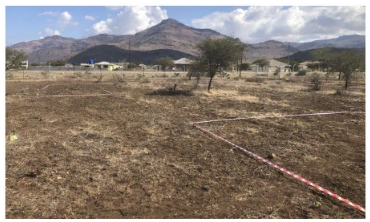
Contractor GeoMech has set out its laydown area to commence drilling within the newlyconstructed security fence

Preparations at the site are underway after the Company awarded a drill contract to Geomech Africa (Pty) Ltd, following a successful tender process.