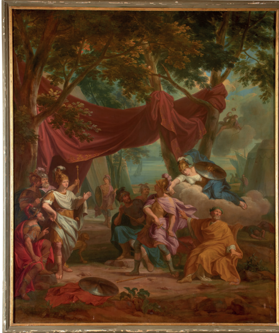
ATTRIBUTED TO CLAUDIO FRANCESCO BEAUMONT Chryseis returned to her father and Quarrel of Achilles and Agamemnon, Oil on canvas, a pair Dimensions : 233 x 196 cm Estimate : €40.000 - €80.000